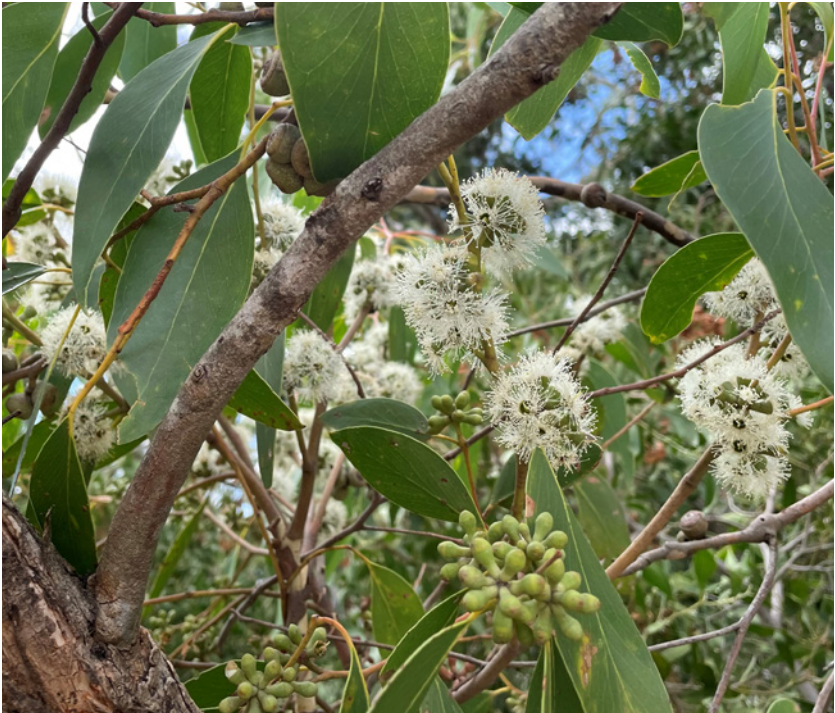
E. arenacea flowering in the Naracoorte Caves National Park this year.

To study the blooming and capsule production of stringybarks for Red-tails, researchers from Melbourne University are asking for some local help. If you live in the Red-tail's range it is easy to help. When you cross paths with brown or desert stringybark, simply take some photos showing its flowers, buds, and/or capsules and send them to the email: stringybarks@gmail.com including date and place. The camera on your mobile phone will be fine. To share the location of your photo you may: A) Open your Maps app and tap the location of the tree on the screen and then take a screenshot where the coordinates are visible (this method is preferred), or B) Send a description of the location as accurately as possible. You may send regular photos throughout the year and the landscape, and you don't need to identify the species. The more examples you send the more we will learn. Contact stringybarks@gmail.com for more information.