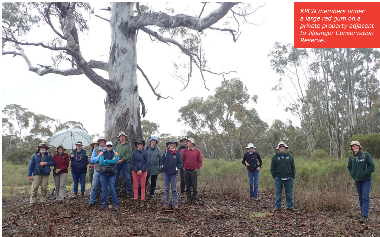
KPCN members under a large red gum on a private property adjacent to Jilpanger Conservation Reserve.