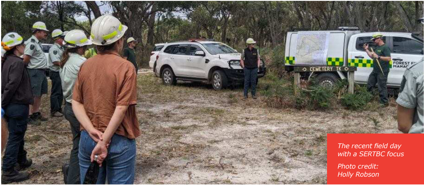
The recent field day with a SERTBC focus