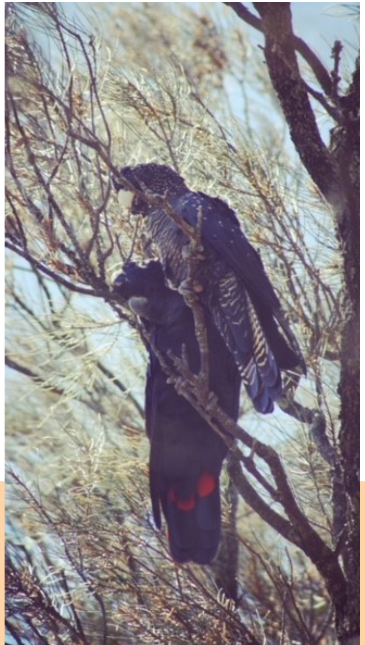
A pair of cockies enjoying the shade in some buloke north of Apsley