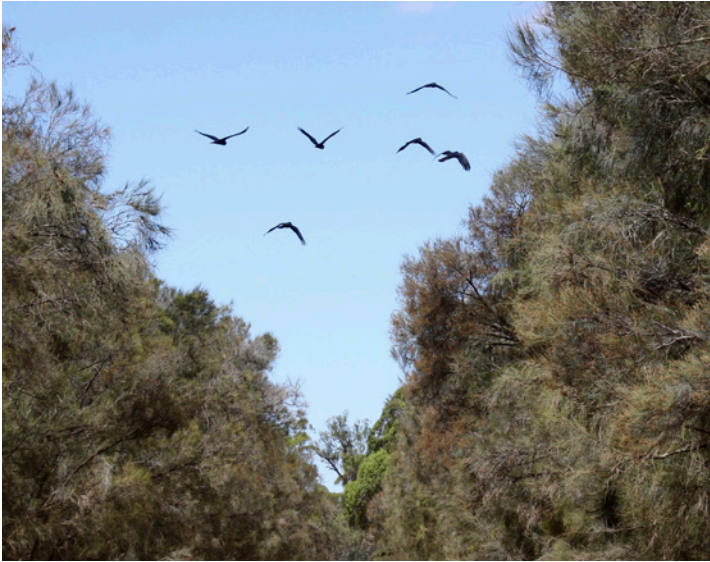
A small flock flying between roadside buloke