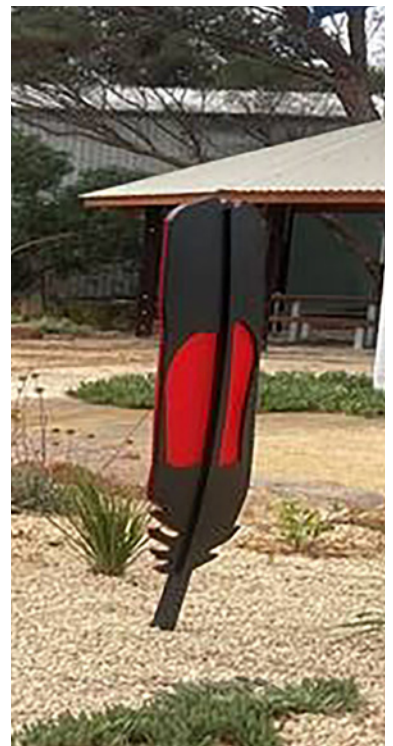
The new steel cut feathers in the Frances Town Square.