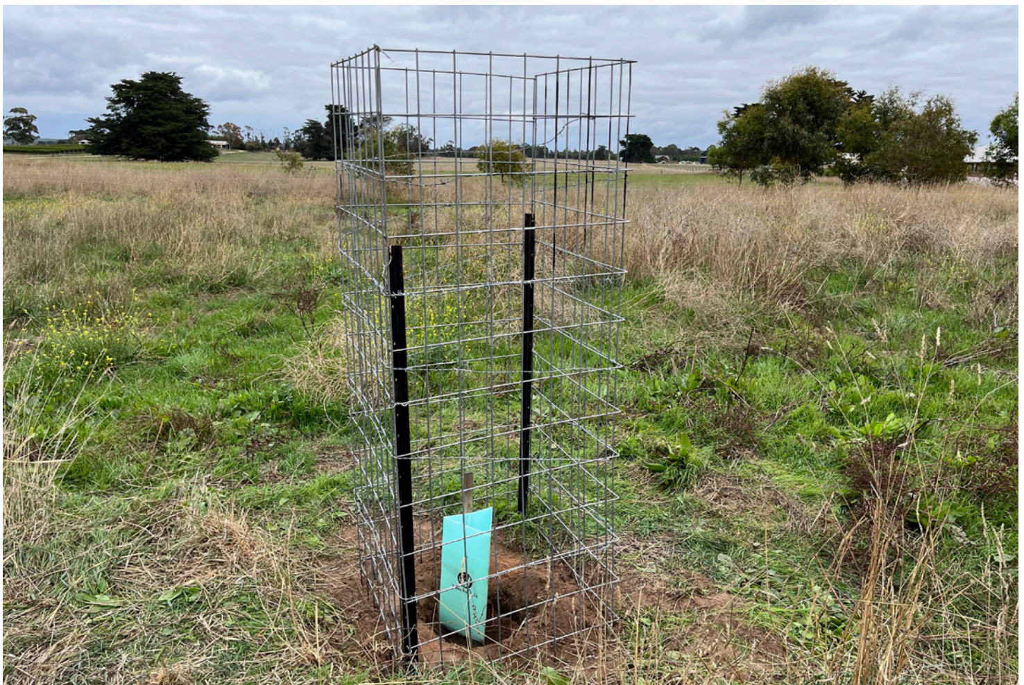
Mallee mesh cattle guard.