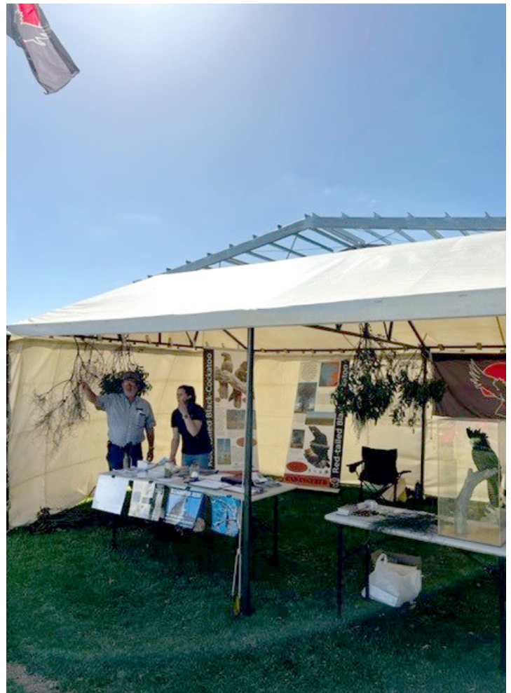
The Lucindale Field Days stall and team.